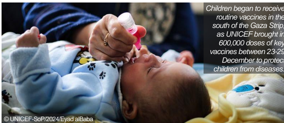
Children began to receive routine vaccines in the south of the Gaza Strip, as UNICEF brought in 600,000 doses of key vaccines between 23-29 December to protect children from diseases.